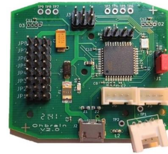
Ohbrain V2.0 board