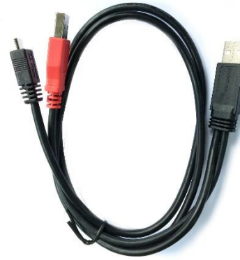
Dual USB cable